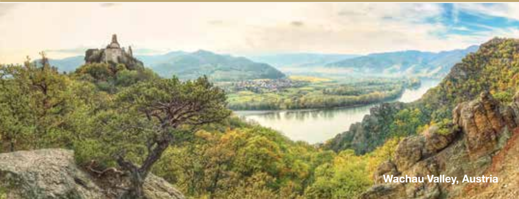
Wachau Valley, Austria

No credit card is required at cruise check-in, and Scenic's River Cruise Guarantee insures against unforeseen disruptions during your cruise.